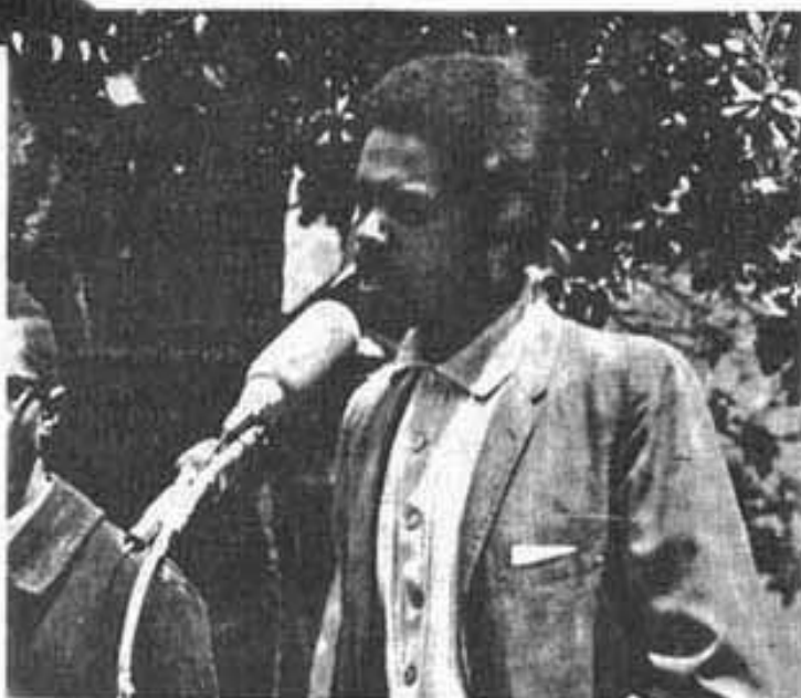
Bobby Seale, Black Panther Chairman

On November 13, 1967, the Alameda County Grand Jury after hearing the evidence went to lunch, re-