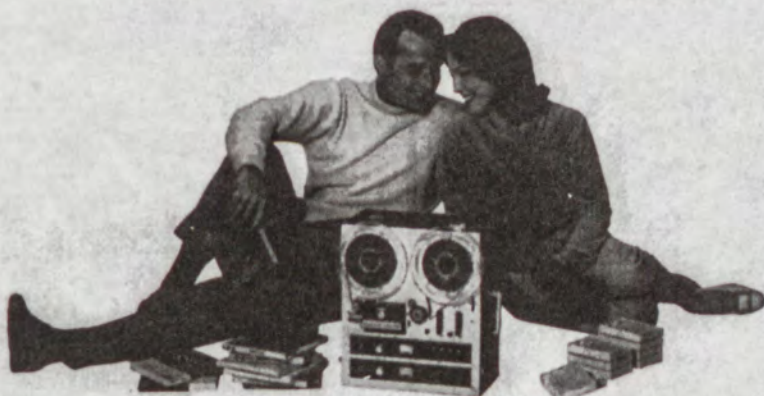
Model 1725-8L III—less than $360