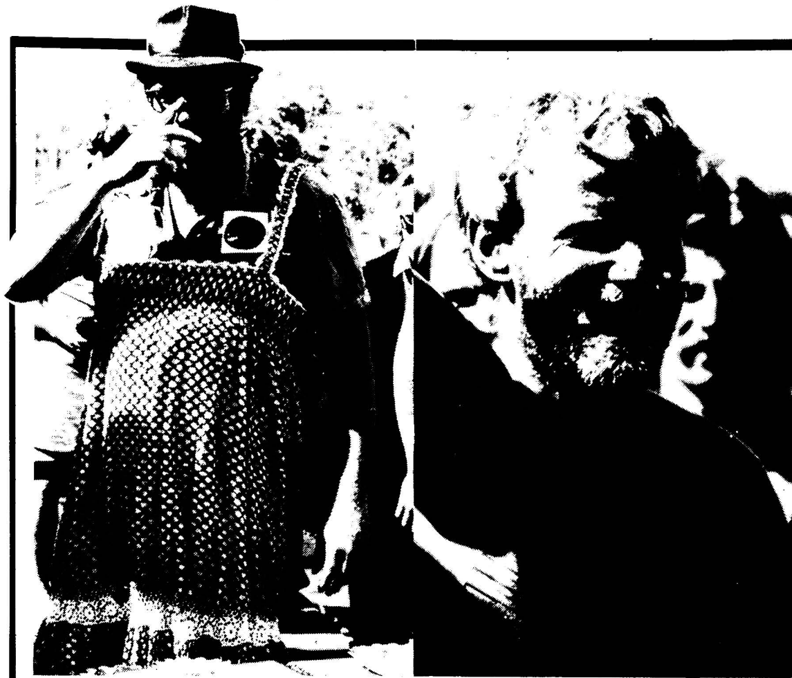
Pre-contest favourite (left) and the eventual winner of the Banana Split Eating Competition at the No-Choice Fete.